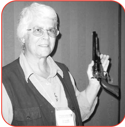
Don't mess with desperate writers...

of her family during and after World War II that is being released this month by the University Press of Mississippi.