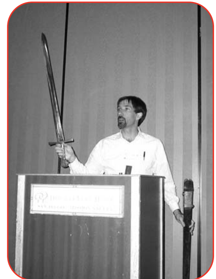
"From Swords to Six Guns" gave aspiring writers an up-close and personal look at some of the typical weapons included in manuscripts.

Industry experts were on hand to discuss how to produce screenplays from inception to finished product and how to attract the necessary attention to get them produced.