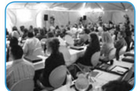
Classroom-style seating to accommodate the 300 attendees