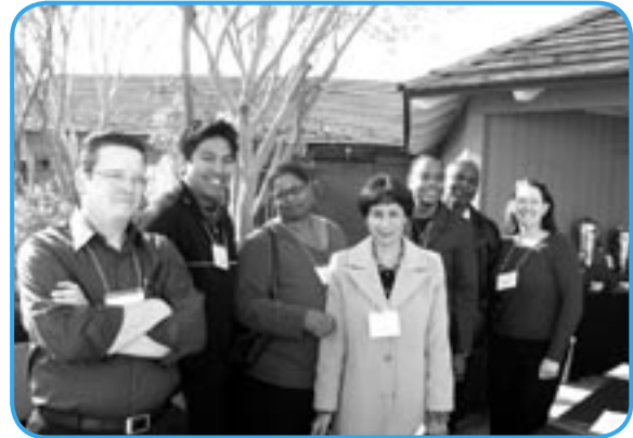
SDSU College of Extended Studies Registration Team